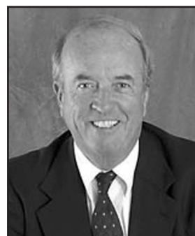
Senator Robert Creedon