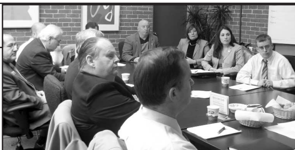
Ambassadors met recently to discuss current issues and new ways to support Chamber member businesses.

The Ambassador Team meets on a monthly basis to serve fellow members by providing information, resources, member-to-member support, increasing awareness and promoting active participation in Chamber programs and services.