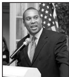
Governor Deval Patrick

The legislative edition of the Good Morning Metro South breakfast program is scheduled for Thursday, April 26 . Registration begins at 7:00 a.m. The program will begin promptly at 7:29 a.m. The event will be held at the Massasoit Conference Center on Crescent St. in Brockton.