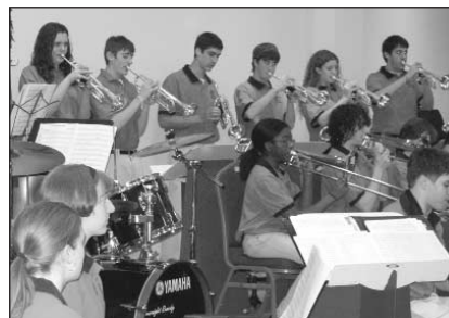
Brockton High Jazz Band performs at 2006 "Taste"