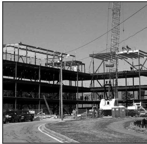
New Science Center Stonehill College, Easton