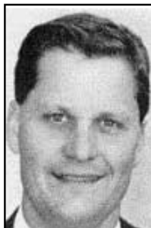
State Senator Robert Hedlund