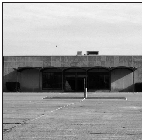
New 12 Screen Movie Theatre Westgate Mall, Brockton