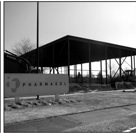
Pharmasol Norfolk Avenue, Easton