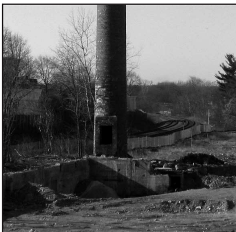
WB Mason Expansion 70 East Battles Street, Brockton