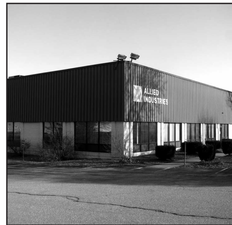
Kinnealey Quality Meats, 70 new jobs 1100 Pearl Street, Brockton