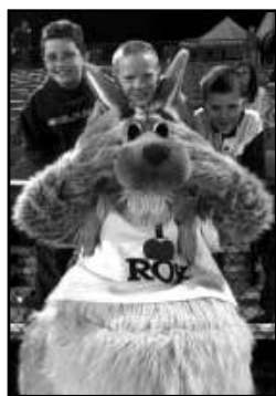
K-O, Mascot of the Brockton Rox

The Brockton ROX will host a Business After Hours at the Shaw's Center, 1 Feinberg Way, Brockton, on Thursday,