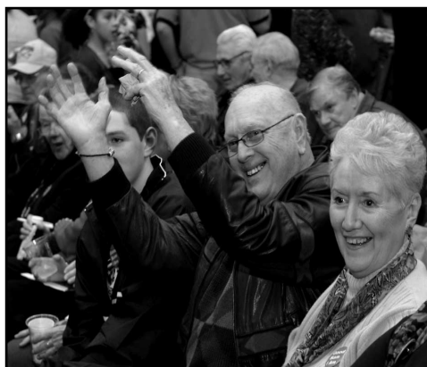
A crowd enjoys the entertainment at the Taste