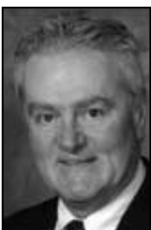
Brockton Mayor James Harrington