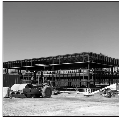
Whelan Associates, LLC, Office Space for Rent 31 Roche Brothers Way, Easton