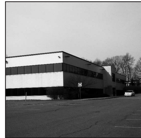
Limited Equity Partners 560 Oak Street, Brockton