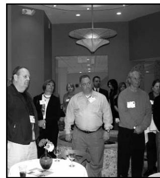
Over 75 people attended the event held at Makeovers Salon and Spa