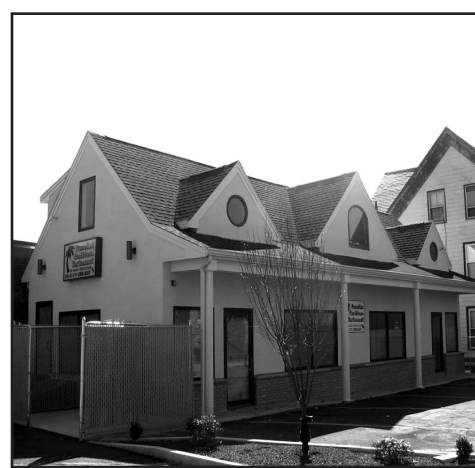
Paradise Caribbean Restaurant Corner of Warren Ave., and West Elm St., Brockton