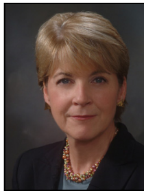
Attorney General Martha Coakley

Martha Coakley has dedicated the last 20 years of her life to a career in public service. Coakley has a strong history as an advocate-not only for individuals and communities, but also for the best interests of the Commonwealth.