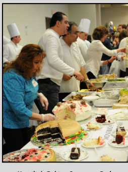
Montilio's Baking Company; Racks; Stoneforge Grill