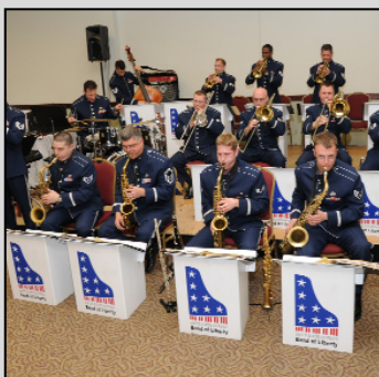
United States Air Force Liberty Big Band