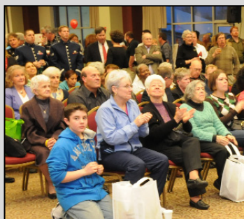
A crowd enjoys the live entertainment