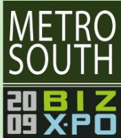
Business Expo, Page 11