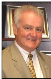
Brockton Mayor James Harrington