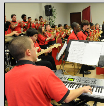
Brockton High School Jazz Band