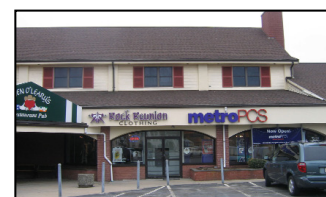
The new MetroPCS located at 1280 Belmont Street, Brockton in the Michael's Plaza

Metro PCS recently held a ribbon cutting ceremony at their new location, 1280 Belmont Street, Brockton. The wireless company provides unlimited plans with flat rates as low as $30/month, no activation fees, and no contracts. Launched in 2002, more than 5 million people are now part of the MetroPCS network with thousands more joining everyday. For more information, call 508.427.5855 or visit www.metropcs.com