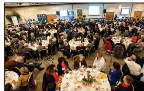
A crowd of over 420 business and community leaders attend the Chamber's 102nd Annual Meeting Luncheon & Business Expo