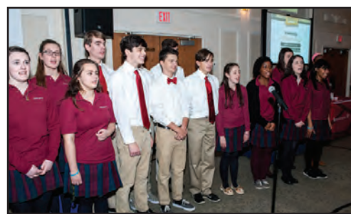
The Cardinal Spellman High School Cabaret Choir sings the National Anthem at the start of the Annual Meeting