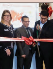
IM Wireless Ribbon Cutting, page 5

To best serve the unique interests and needs of member businesses and to champion the broader economic vitality of the Metro South region.