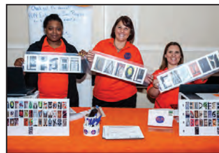
FUN Enterprises, Inc. runs an interactive letter art activity that guests can take as a giveaway.