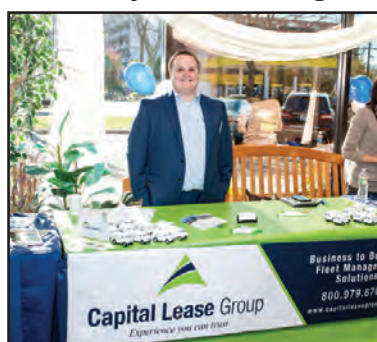
Al Lawrence Capital Lease Group