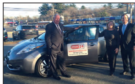
Attendees had the opportunity to test the 100% electric, no gas Nissan LEAF during a ride & drive event with Nissan 24