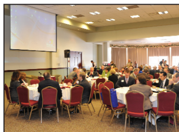
100 people recently attended the Good Morning Metro South Breakfast Meeting now held at the Shaw's Center, Brockton