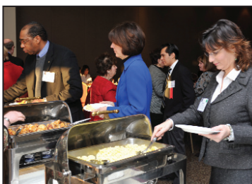
Attendees enjoy a hot breakfast buffet prior to the event.