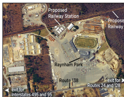
Convenient location near Routes 24, 128, 495, 95, and the proposed railway station make Raynham Park an ideal gaming site should legislation pass

and the Governor to approve Raynham Park as a designated gaming site should the legislation be approved. The designation could save more than six hundred jobs slated for elimination as a result of the recent ban on greyhound dog-racing by the state of Massachusetts.