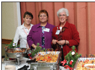
Staff of St. Joseph Manor serve delicious food to over 80 Chamber members in attendance.