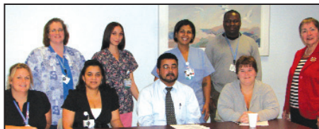
Higher Education Collaborative Focus Group at Signature Healthcare

Nurses. Over 35 health care workers participated in the focus groups and all were interested in attending courses that would develop their skills to help them advance their careers.