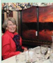
Plymouth County Railroad Excursion, page 10