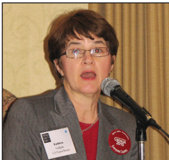
Kathleen Ludgate, Regional Director of the U.S. Census Bureau discusses the "10 in 10" 2010 Census Campaign (see page 6).