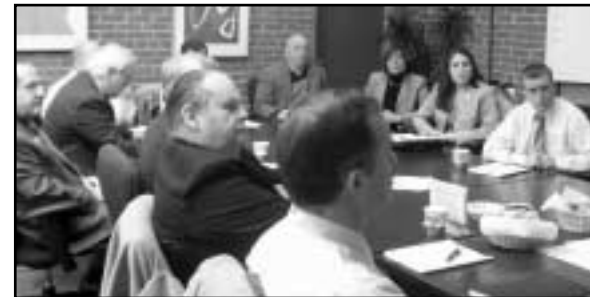
Ambassadors met recently to discuss current issues and new ways to support Chamber member businesses.

The Ambassador Team meets on a monthly basis to serve fellow members by providing information, resources, and member-to-member support, increasing awareness and promoting active participation in Chamber programs and services. Presently, there are over twenty