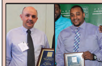
See page 9