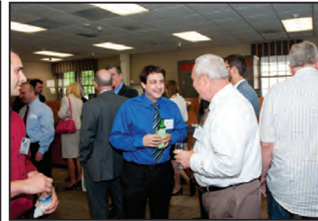
A full room of guests enjoy networking and complimentary appetizers and beverages from Abington Ale House