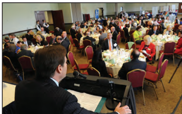
More than 180 people attended the 2015 Small Business Awards held at the Shaw's Center in Brockton.

The Small Biz EXPO featured over 40 local companies.