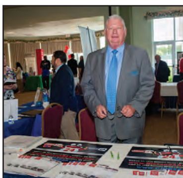
Hank Tuohy Nissan 24