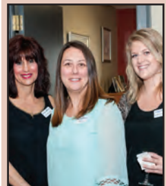
Abington Bank Event page 6