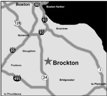
Brockton is located on major routes and in close proximity to Boston, Providence and Plymouth