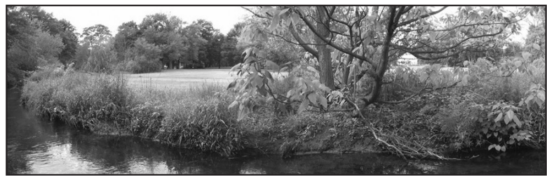
George Snow Park