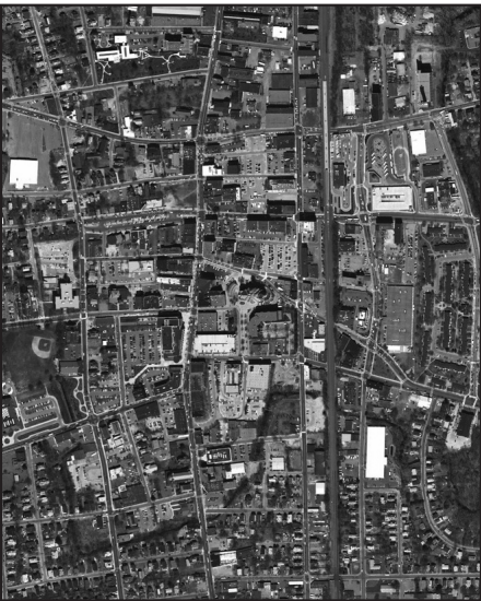
Aerial View of Brockton