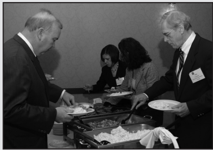
Attendees enjoy the Brockton Holiday Inn Buffet