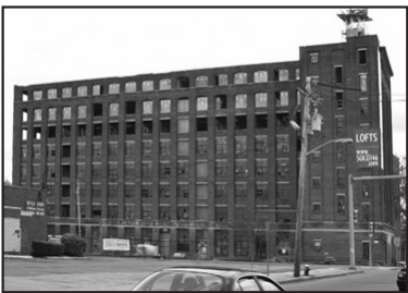
Soco Lofts at BAT Intermodal Centre