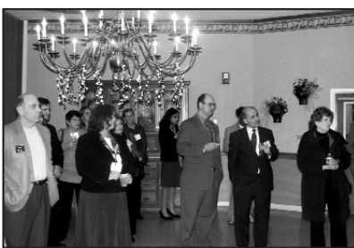
A full crowd at St. Joseph Manor