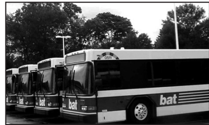
Brockton Area Transit Authority