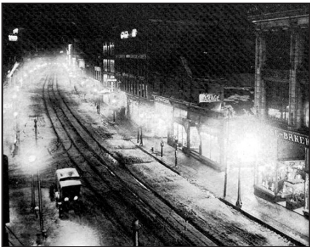
Brockton had the first electrified Main Street thanks to Thomas Edison and his work in the city.