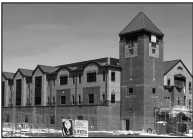
Arnone School located at the edge of Keith Memorial Field