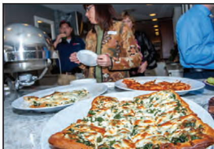
Guests enjoy delicious catering from Tutto Bene and freshly baked desserts in the Wood Palace Kitchens working oven