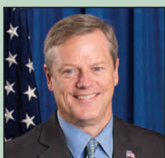
Gov. Baker to Address Chamber, page 11