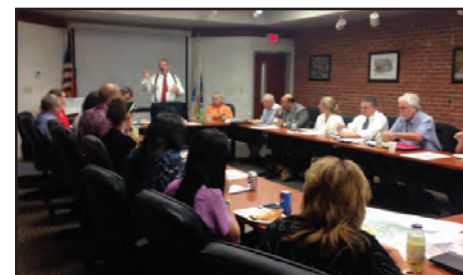
A series of "Working Cities - Brockton Planning Team" meetings as well as "Transformative Development Initiative (TDI)" meetings were held at the Metro South Chamber recently to discuss development of downtown Brockton.