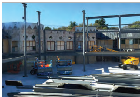
Old Colony YMCA's Stoughton branch is undergoing a $4.2 million expansion on Central Street, which will add approximately 23,280 square feet to the existing building and create more parking spaces. Left: project in May; right: project in October