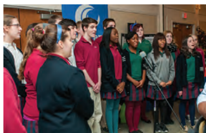
Students from Cardinal Spellman High School in Brockton perform at the Chamber's last Annual Meeting.