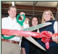
Banner Environmental Ribbon Cutting, page 6