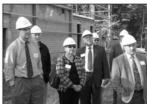
Chamber board members get a close look at the 70 million dollar construction project

Members of the Metro South Chamber of Commerce Board of Directors recently toured the only desalination plant in New England. The plant is located on the Taunton River in Dighton, MA and will supply ample water to Brockton and Norton beginning in May 2008. The Metro South Chamber hosted a regional water forum at Stonehill College in 1998 that fostered the desalination plant's support and construction.