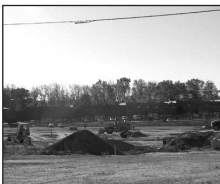
Target (to be completed Fall 2008) Rt. 139, Stoughton