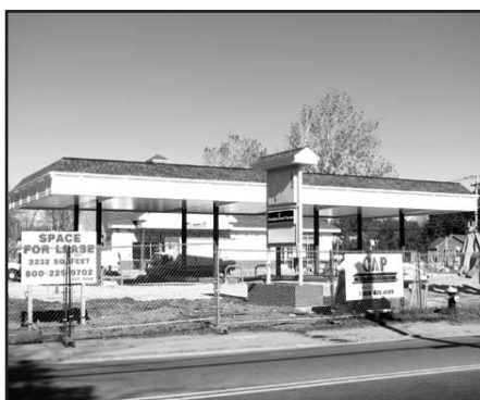
Cumberland Farms Corner of Rt. 106, Bridgewater