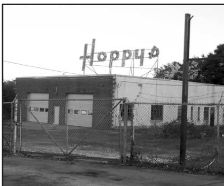
New Home of Lynch's Towing (Formerly Hoppy's oil site) Monetello Street, Brockton