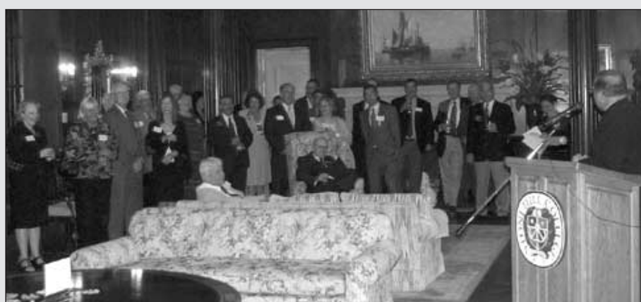
Legislators and Chamber members gather at the 18th Annual Legislative Reception at Donahue Hall, Stonehill College