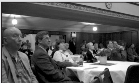
Many in attendance for the War Memorial Groundbreaking