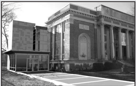
Architects Elevation of the new elevator for the War Memorial Building