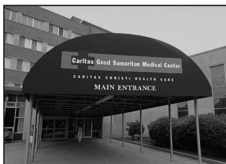
Caritas Good Samaritan Medical Center, Brockton

The next Business After Hours will be held at Caritas Good Samaritan, 235 North Pearl Street, Brockton on Thursday, November 29 , from 5:30pm-7:30pm.