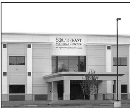
Compass Medical Rt. 18, East Bridgewater