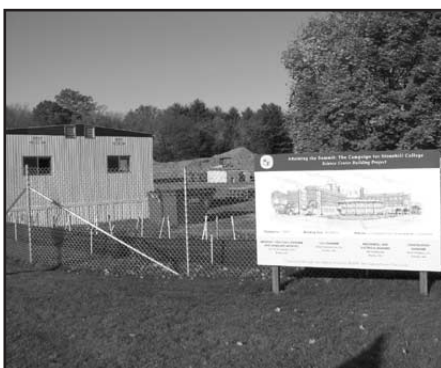
New Science Building Stonehill College, Easton, MA