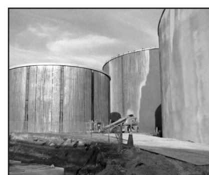
Large tanks will hold water and brine produced by the desalination process