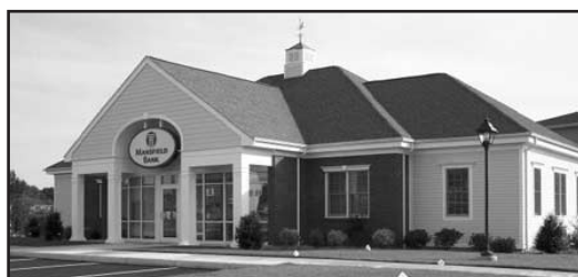
Mansfield Bank, West Bridgewater. Located conveniently off of Rt. 106 and Rt. 24, next to Lowe's and The Charlie Horse

The West Bridgewater Branch of Mansfield Bank at 728 West Center Street is now open. The facility will enable Mansfield Bank to offer the convenience of consumer, commercial and investment services.