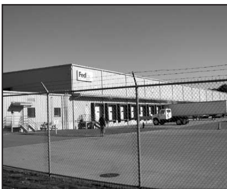
Fed Ex Expansion, Belmont Street, Brockton