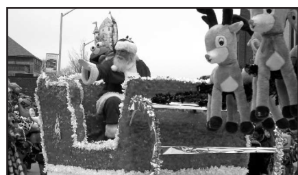
Santa arrives in Brockton November 24th.

The annual Brockton Holiday Parade is being sponsored by the Downtown Brockton Association (DBA), the City of Brockton and the Campello and Montello Business Associations.