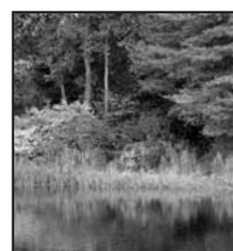
The Taunton River, Dighton, MA