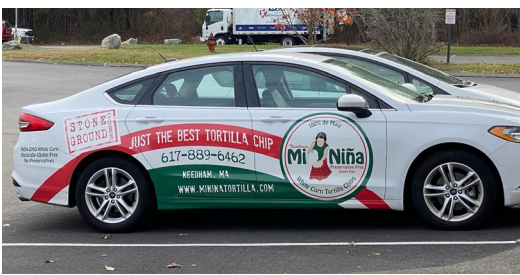
1020 West Chestnut Street in Brockton