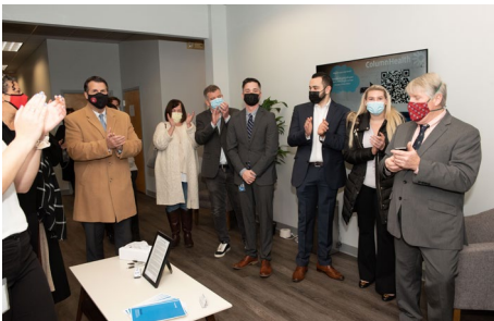
Brockton business and community members, and elected/selected officials gather with Column Health team members to celebrate their grand opening in December at the new downtown location, 231 Main Street, Suite 102, Brockton.