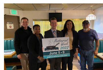
Montello Business Association, Home Cafe 677 N Main Street, Brockton