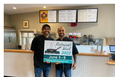
JJ's Caffe, 610 N Main Street, Brockton