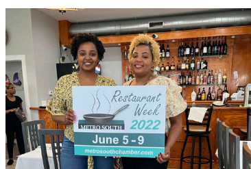
Sodade Restaurant, 1145 Main St, Brockton