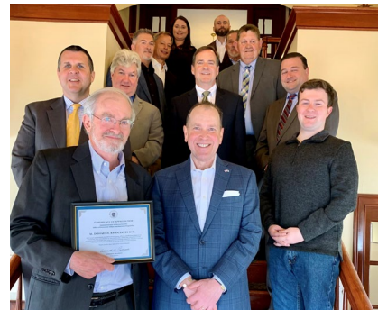
Donahue Associates, 457 Belmont St., Brockton