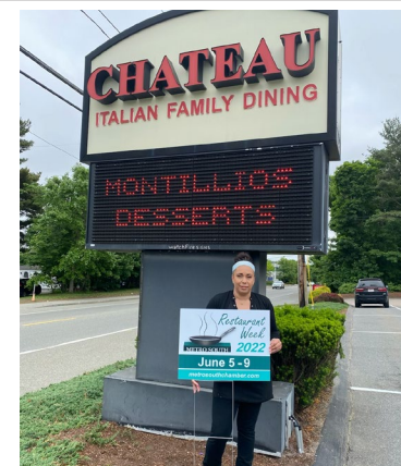
Chateau, 1165 Park St., Rt. 27, Stoughton