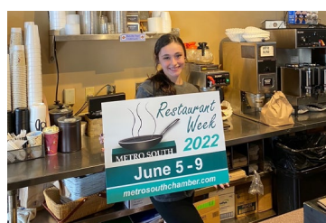
Back Bay Bagel, 1280 Belmont St, Brockton