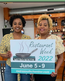
Sodade Restaurant, Brockton • Page 5