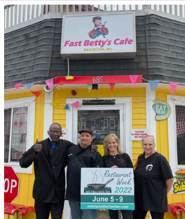
Fast Betty's Cafe, 685 Warren Ave., Brockton