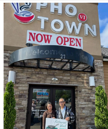
Pho Town 6, 27 Westgate Drive, Brockton