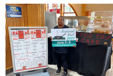
Lady C&J Cafe, 10 Commercial St., Brockton

1048 Bar & Grill 1048 N Main Street, Randolph (781) 963-9812 1048bar.com Style: American Special: Steak Tips $19.99, Baked Haddock $17.99