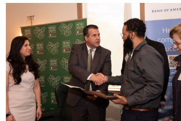
Mayor Sullivan presenting a Citation to Grand Flourish Collective