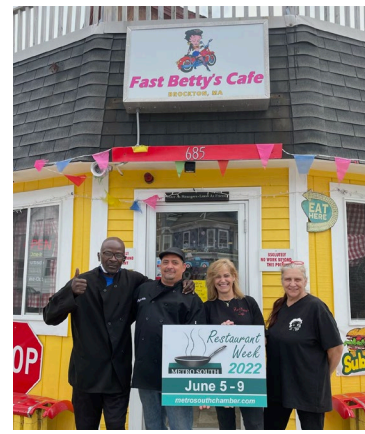
Fast Betty's Cafe, 685 Warren Ave., Brockton