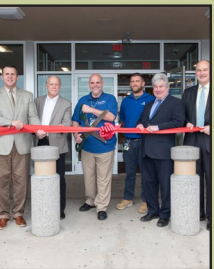
Porter and Chester Institute, Brockton Campus Page 6