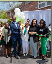
Healthier You Wellness Partners, Brockton Page 7