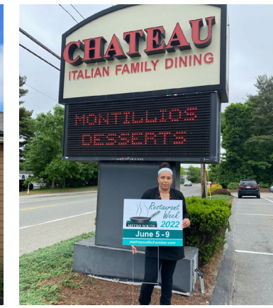
Chateau, 1165 Park St., Rt. 27, Stoughton

The Metro South Chamber of Commerce is pleased to announce that, working with Brockton, Easton, Avon, Whitman, Abington, East Bridgewater, West Bridgewater, Randolph, Stoughton, the Chamber, will run the 2nd Annual “Regional Restaurant Week” from Sunday, June 4th through Thursday, June 8th.