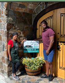
Porton Di Nô Ilha 820 Main St., Brockton Page 6