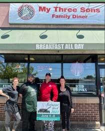
My Three Sons Diner 1050 Pearl St., Brockton Page 6