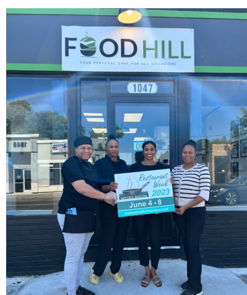
Food Hill, 1047 Main Street, Brockton