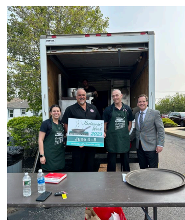
Abington Ale House, 1235 Belmont St., Abington