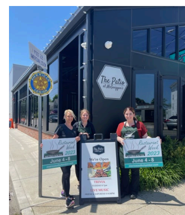
The Patio, 552 Washington Street, Whitman

The Metro South Chamber of Commerce is pleased to announce that, working with Brockton, Easton, Avon, Whitman, Abington, East Bridgewater, West Bridgewater, Randolph, Stoughton, the Chamber, will run the 2nd Annual “Regional Restaurant Week” from Sunday, June 4th through Thursday, June 8th.