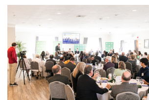
(right) Thank you BTV for recording this sold out event!