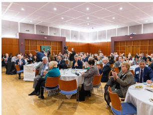
Sold out luncheon at the Martin Institute @ Stonehill College in Easton! Thank you for joining us.