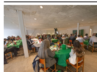
Sold out event at Concord Foods’ beautiful luncheon area drenched in natural light.