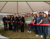
Natural Agricultural Products Ribbon Cutting in Abington • Page 6

To best serve the unique interests and needs of member businesses and to champion the broader economic vitality of the Metro South region.