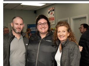
North Easton Savings Bank