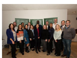
Leadership Metro South Cohort attended this event as part of a manufacturing education day.