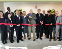
"The Anglim" redeveloped 55-unit Brockton building Ted Carman • Page 7