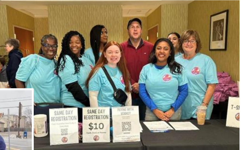
Family and Community Resources