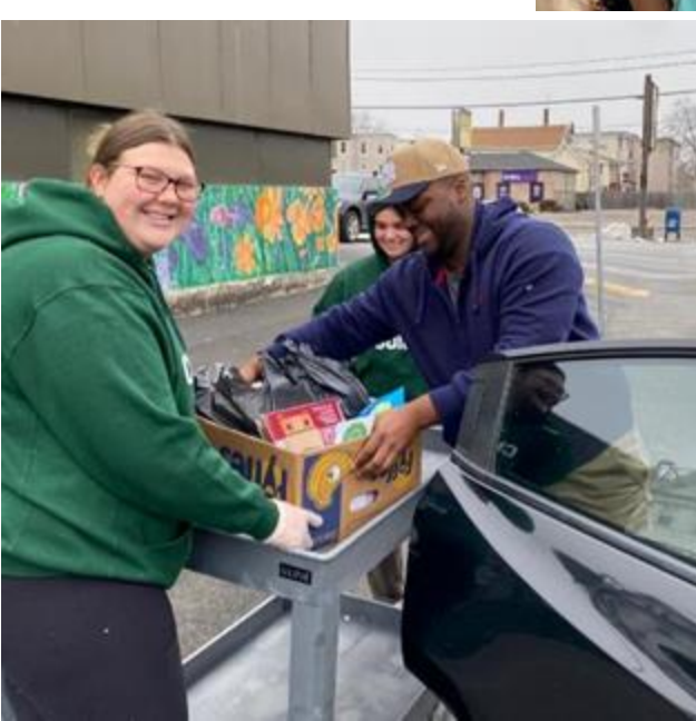
The Charity Guild