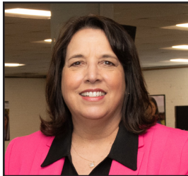
Kim Driscoll MA Lieutenant Governor