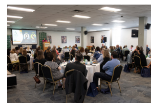
Sold out luncheon at Massasoit Community College Student Union Center on Brockton Campus.