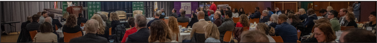
Good Day Metro South luncheons feature economic development panels highlighting key projects, trends, and growth opportunities—bringing leaders together to shape our region’s future.

Company Name: _____ Fax: _____ Phone: _____ E-mails: _____ Names: _____