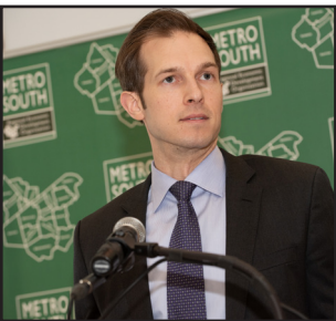
Congressman Auchincloss Fourth District of MA