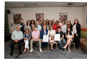
JM Pet Resort staff and family photo with recognitions and awards.