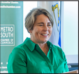
Maura Healey Massachusetts Governor

Become a Season Ticket Holder 2025 - 2026