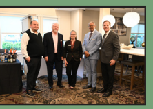
Networking at Residence Inn Brockton/Easton with SCU Credit Union • Page 6

Chamber Mission To best serve the unique interests and needs of member businesses and to champion the broader economic vitality of the Metro South region.