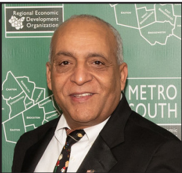
Moises Rodrigues Brockton City Councilor-at-Large