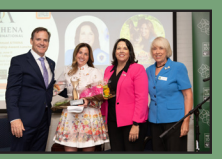
ATHENA Award Spotlight Women's Leadership with Eastern Bank • Page 7