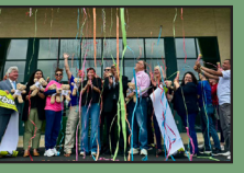
Urban Air Trampoline and Adventure Park Opens in Brockton • Page 6